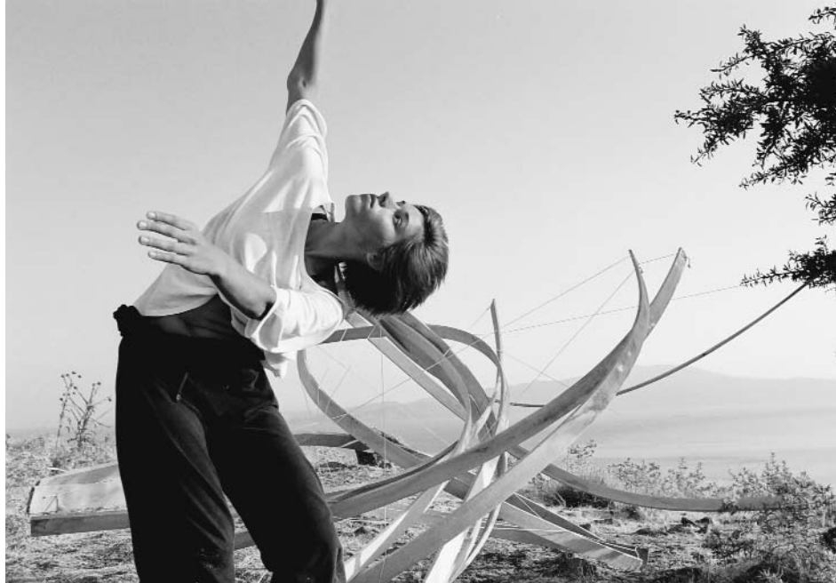
►► Duet Dance - Sculpture